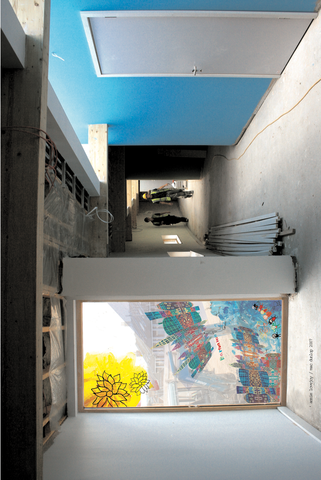
' arnie lovejoy / mac dunnop 2007