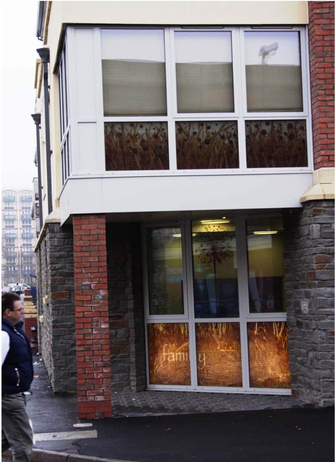
1 st floor meeting room windows & ground floor reception glazing