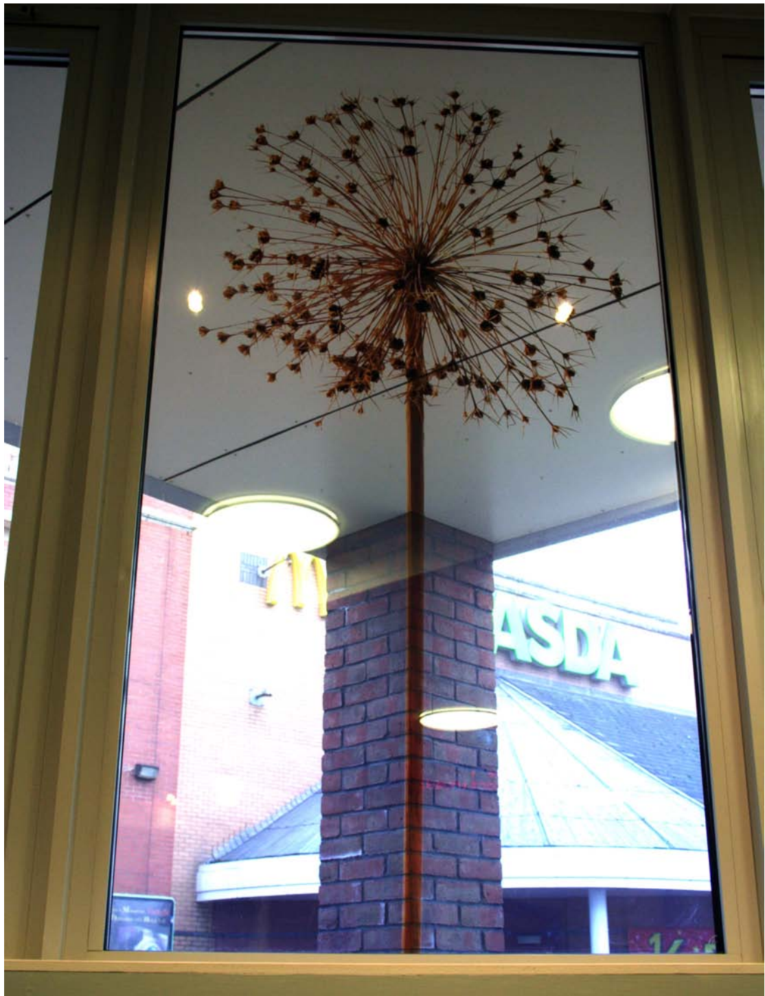
high resolution photographic transparency embedded in double glazed unit (view from inside).