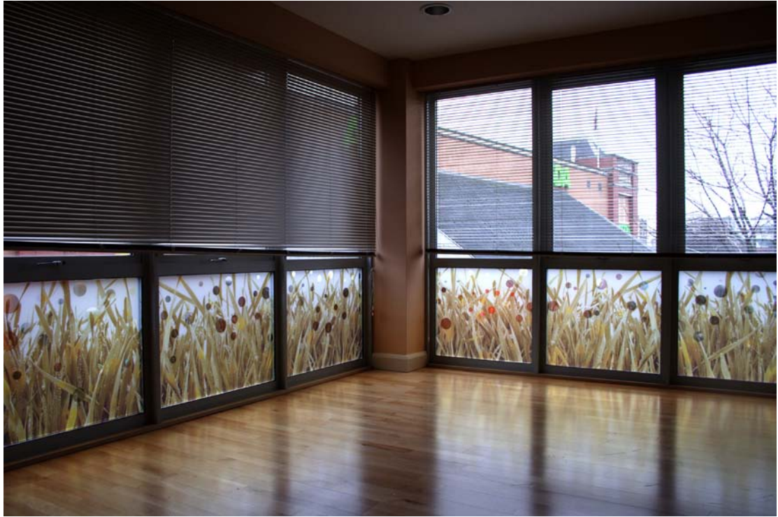
meeting room windows