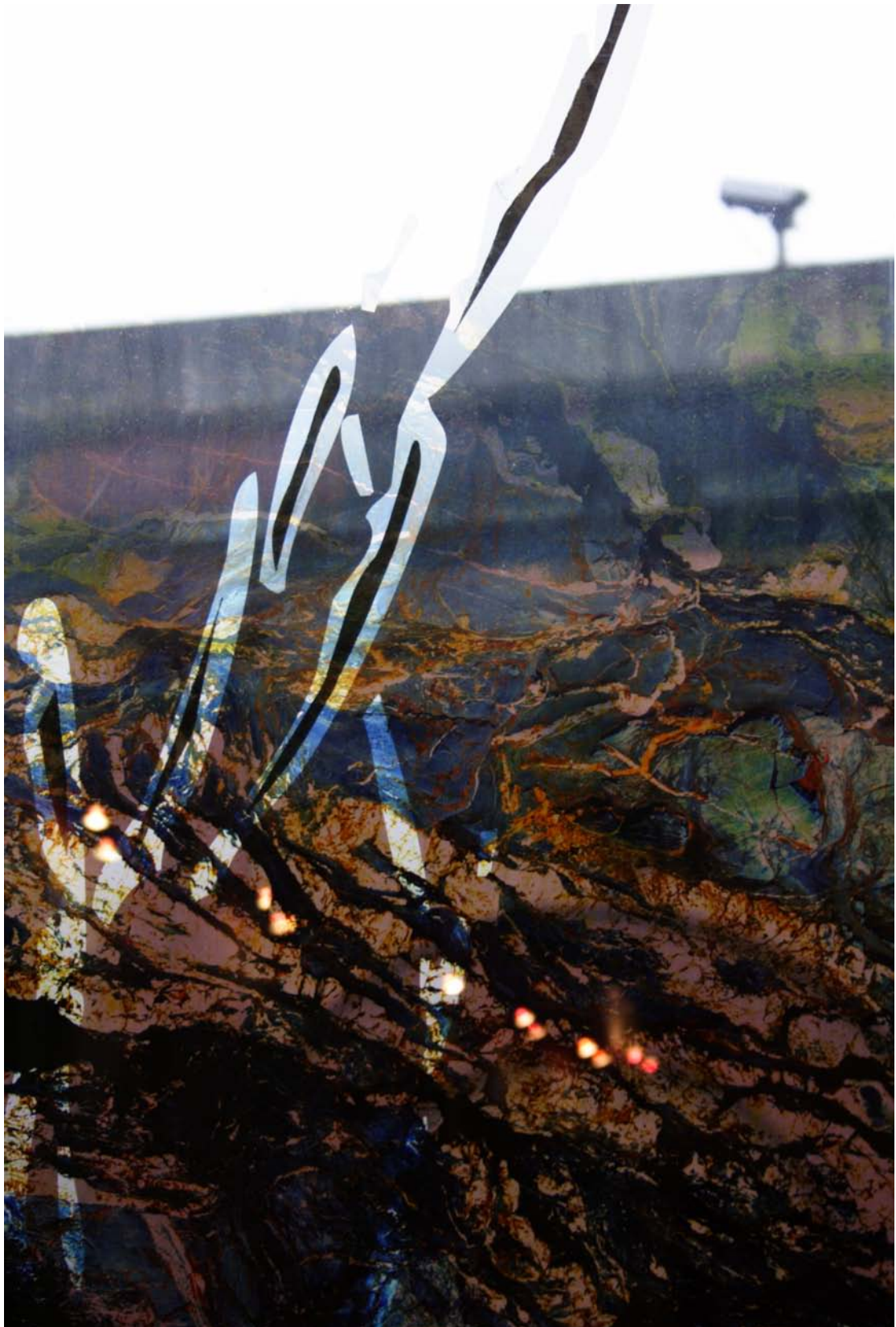
detail of photographic / etch DGU panel from inside foyer seeing through to building opposite