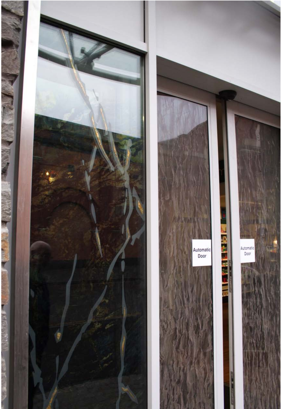
view from outside showing etch / painted side panels & silk doors