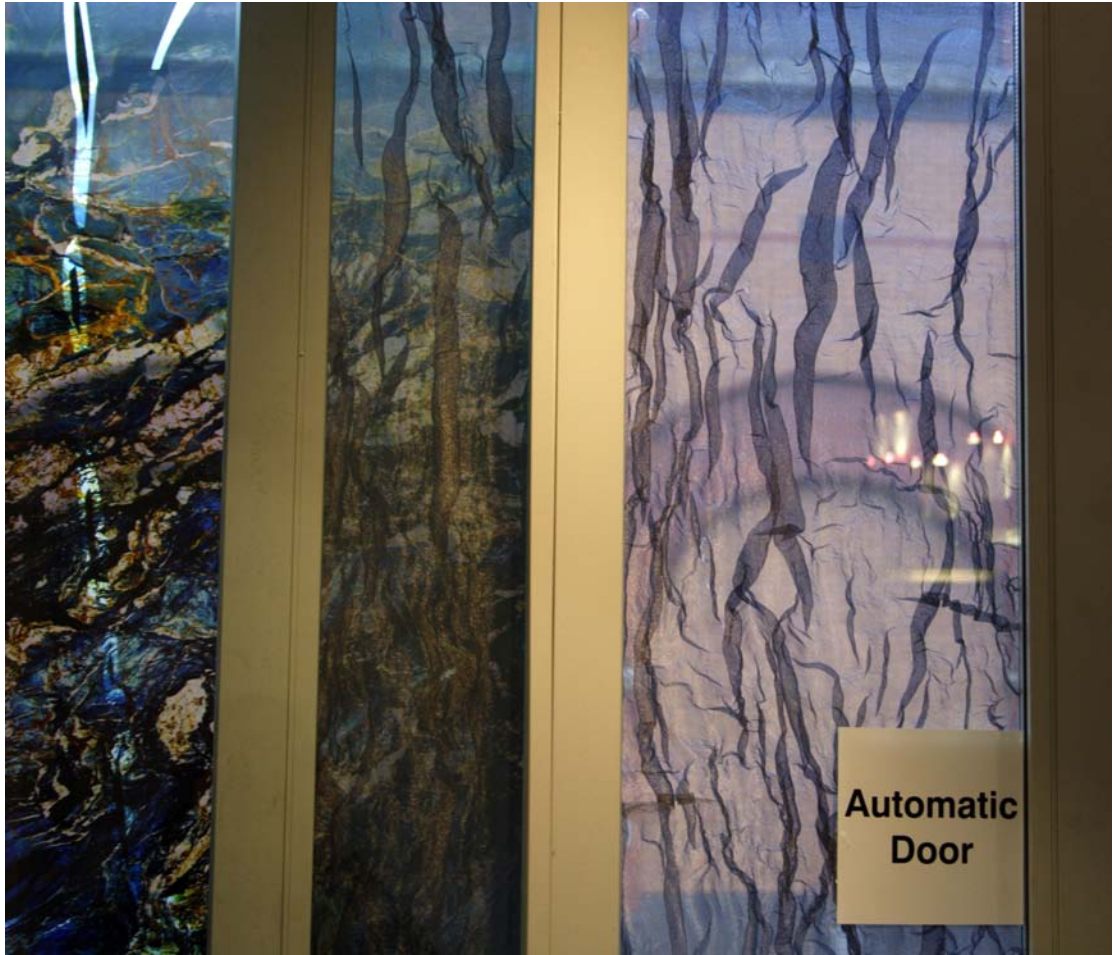
views from inside foyer: shot silk DGU doors sliding across photographic / etch DGU side panel