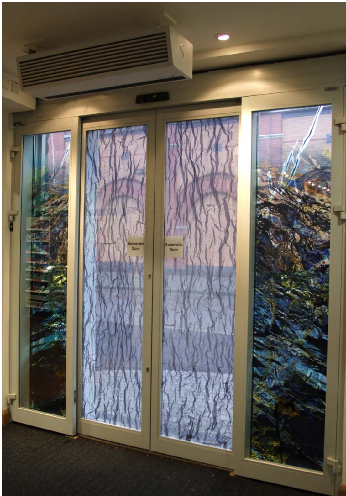
view from inside entrance foyer