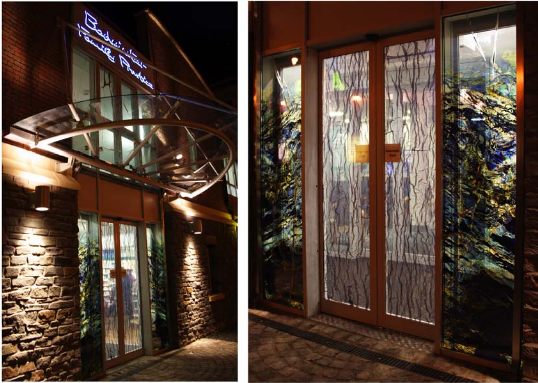
view from outside at night