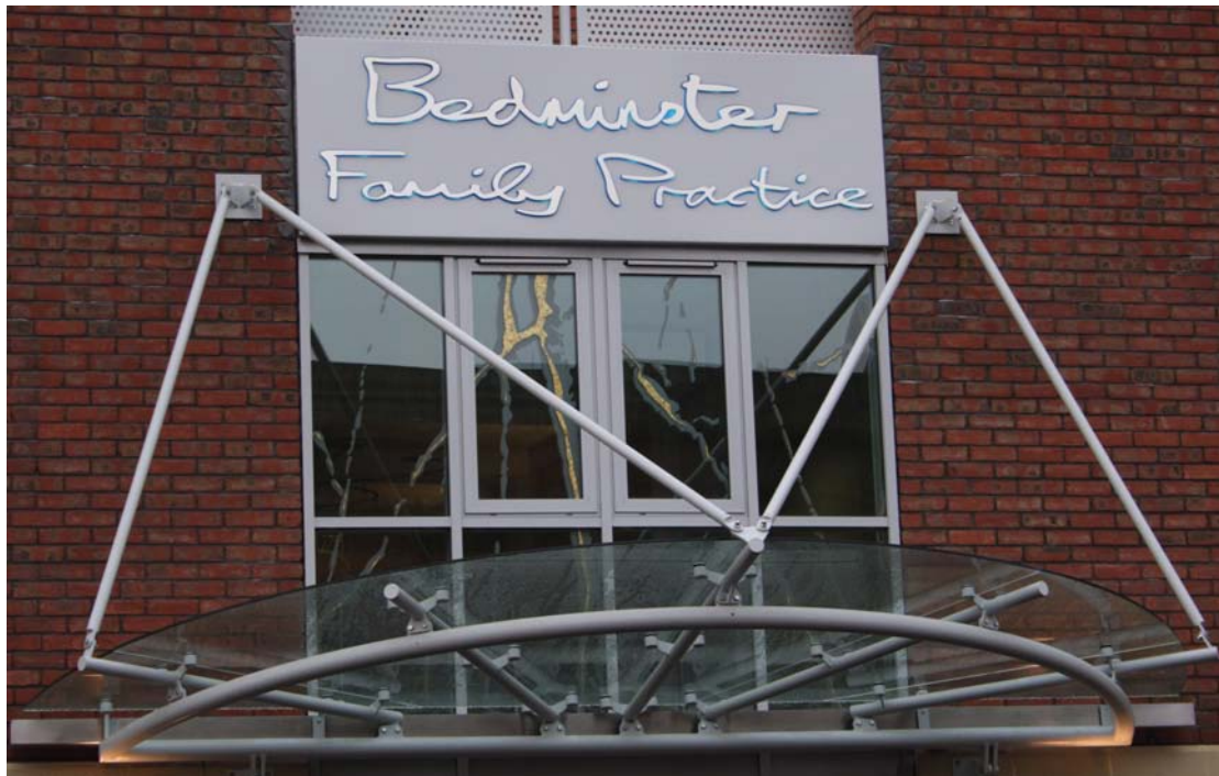
signage: backlit raised aluminium letters above etched / painted top floor DGU panes signage design source: handwriting of Dr Ian Garbutt (GP Practice Partner).