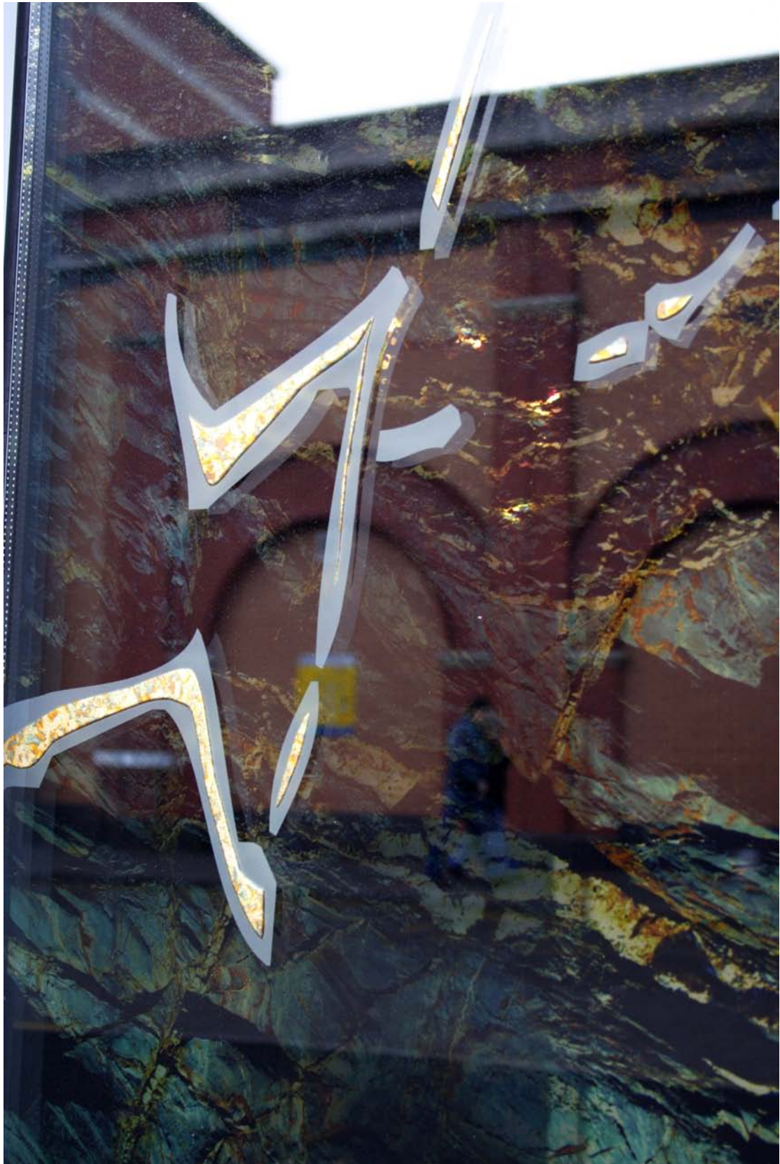
detail of etch / painted side of DGU & with photographic DGU pane behind view from outside with reflection of street